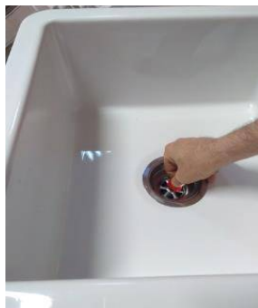
FIGURE - 4

3- The bench is cut on the inside marking