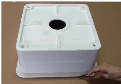
FIGURE - 1

Sink is placed upside down on the counter-top mounting area. The outer edges are drawn all around and marked on the counter.