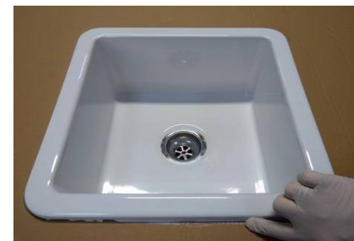
FIGURE - 6

Silicone is applied to the mounting area of the bench countertop.