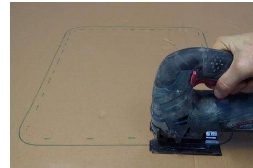
FIGURE - 3

The sink is removed from the mounting area and a second line is drawn 15 mm inside the marked line.