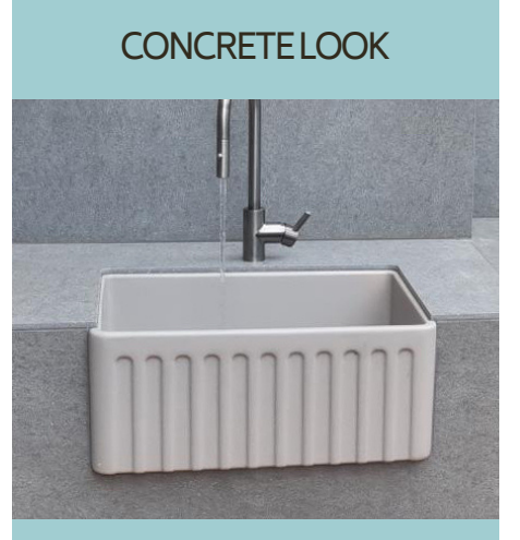
Matte grey with slight varied grey specs to mimic concrete.