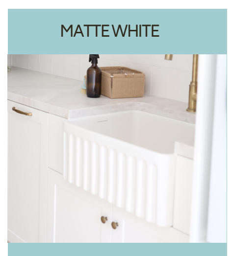
Pure warm white (not bright/ blueish hue). Flat satin matte finish.

Pure warm white (not bright/ blueish hue). High gloss smooth shiny finish.