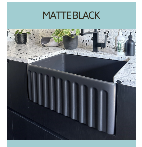
Pure black, no light specs. Richer black than granite.